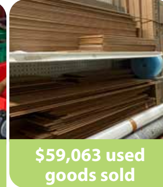
$59,063 used goods sold