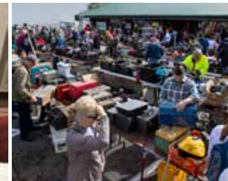
80,000 used tools sold at Tool Sales