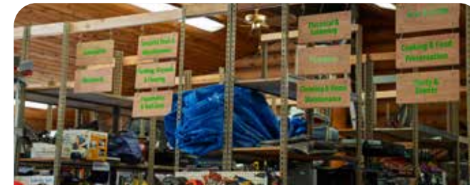
66,058 lbs total weight of donated materials accepted