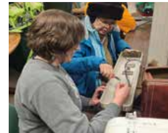
231 items repaired at Fix-It Nights